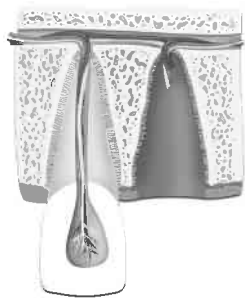
KNOCKED OUT TOOTH